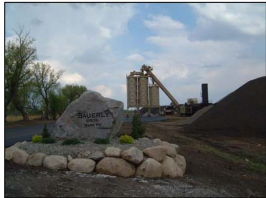
Knife River Corp. - North Central North Branch & St. Cloud Plants