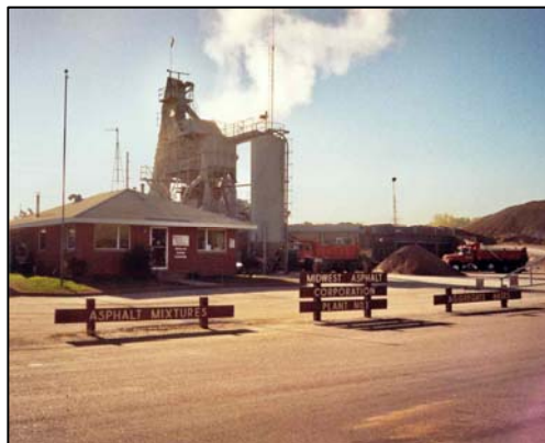
Midwest Asphalt Corporation Eden Prairie Plant