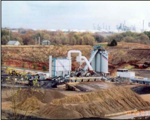
Bituminous Roadways, Inc. Inver Grove Heights & Shakopee Plants

Those who earned the Diamond Achievement [NAPA] and Ecological [MAPA] Commendation Awards in 2010 are as follows: