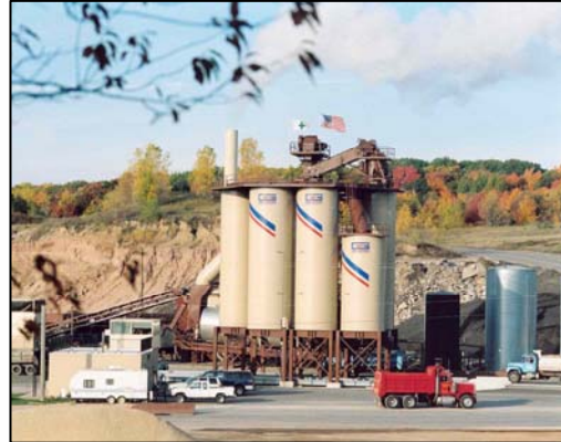
Commercial Asphalt Co. All 10 Plants (Scandia Plant shown)