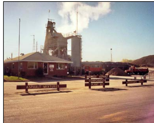
Midwest Asphalt Corporation Eden Prairie Plant