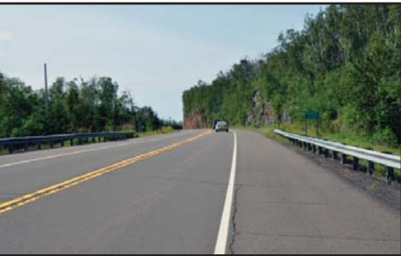
TH 61 near Silver Bay - 2010 Perpetual Pavement Award Winner.

The initial construction of TH 61 began in 1969 and was paved by Ulland Brothers, Inc. out of Cloquet, MN. Four feet of unsuitable material was excavated to correct for adverse subsoil conditions and for uniformity of compacted material. A selected backfill material was used to create a drainable, strong construction platform to pave upon and as a long-lasting foundation.