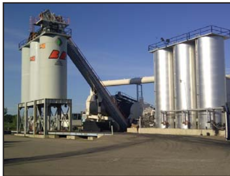
Bituminous Roadways' Inver Grove Heights Plant

Facilities are judged on their design layout, clean operation, conducted tours for neighborhoods/local community groups/school groups and appearance. In order to qualify for the MAPA Ecological Commendation Award, a facility must successfully complete the rigorous National Asphalt Pavement Association (NAPA) criteria for the Diamond Achievement Commendation.