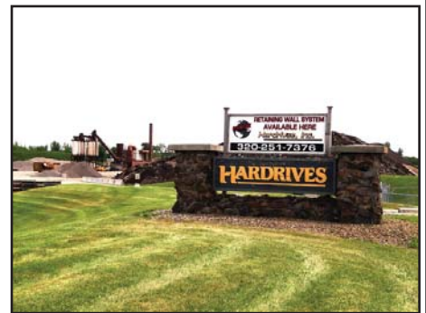
Hardrives' Waite Park Plant