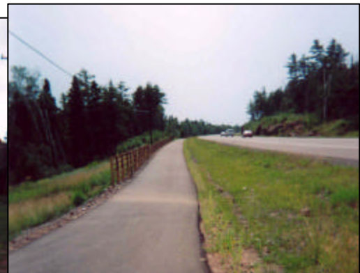
Recently completed Gitchi-Gami State Trail near Beaver Bay.