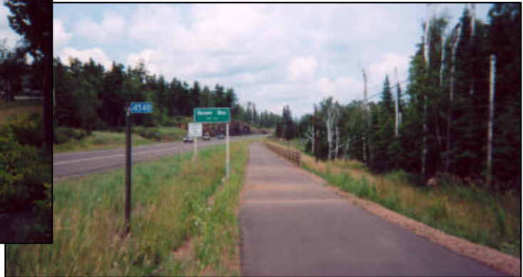
Recreational trail in Duluth (left) and Beaver Bay (right).

The Minnesota Department of Natural Resources lists the locations of Minnesota trails on their website ( www.dnr.state.mn.us ). Minnesota state bicycle trails are best suited to people with physical disabilities, because most trail surfaces are paved asphalt and are 8 to 12 feet wide. There are several other advantages to using HMA for recreational trails including the lowest initial and future maintenance costs, no curing time is required, the ease of construction provides rapid access to users of the facility. Aesthetically, HMA is a flexible pavement that is designed to conform to the rolling terrain with a smooth surface, and the black color of HMA enhances the green surroundings.